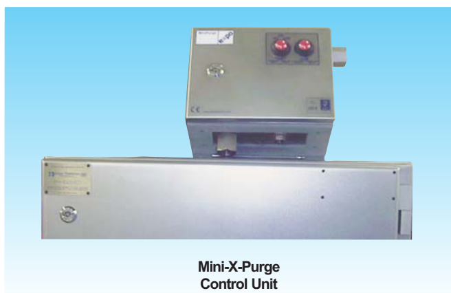
Mini-X-Purge Control Unit

For enclosures up to 1XCF/___/___ 17 cu ft, 0.48 m 3 Zone 1 (21) and 2 (22) Category G D2 ATEX Class I Division 1 FM cULus