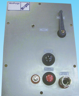
MiniPurge LC Panel Mount