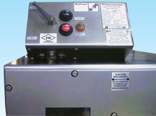
MiniPurge LC Back Plate