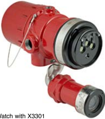
xWatch with X3301